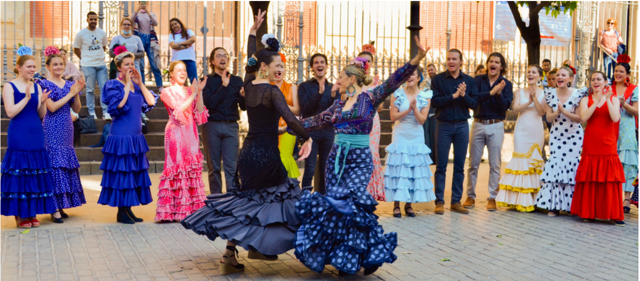
Immersive Spanish language program in Sevilla , Spain