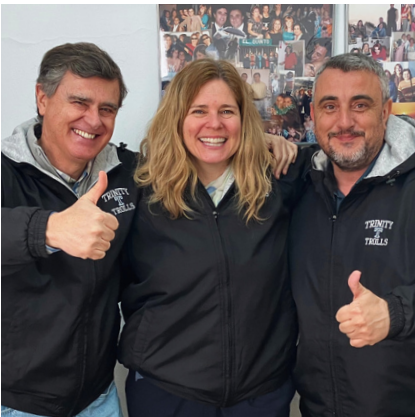
Classes taught by Sevillian professors and homestays with Spanish families