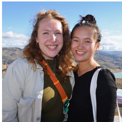
Intercultural Engagement, Immersive Scholarship, & Inclusive Christian Community