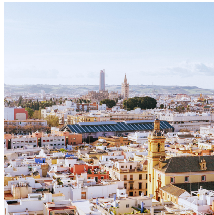
Semesters (Fall & Spring) Summers (Two Terms) Internships & Service Learning